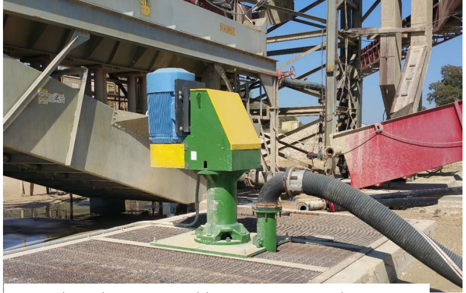
Fig. 1. Schurco Slurry V Series Model 8V200M at aggregate plant in Texas.

Schurco Slurry, a heavy-duty slurry pump manufacturing company specializing in lined centrifugal slurry pumps, is announcing a new approach to a common application found in many stone, sand, and gravel plants. Effluent and overflow process streams are common in many washing and screening plants, and these flows typically carry solids, which can cause wear and tear on standard end-suction pumps. Even lined horizontal slurry pumps like the Schurco S Series experience seal failures and other